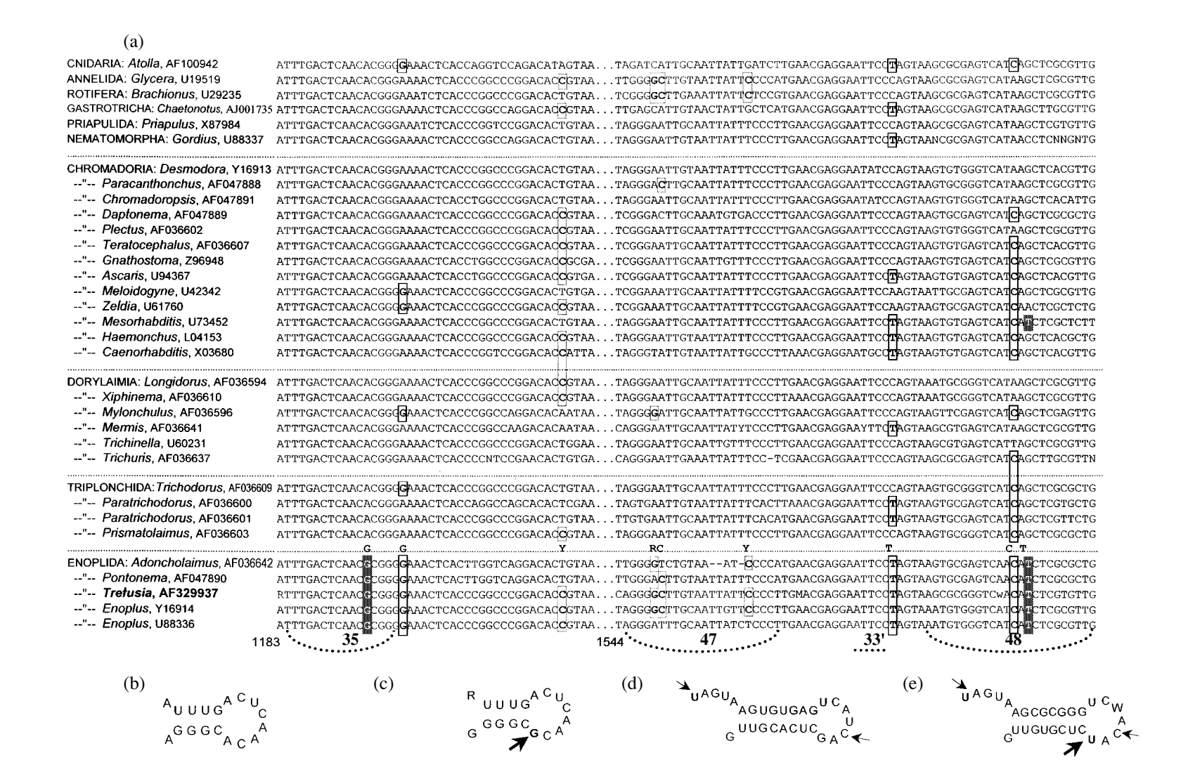
Fig. 2. Localization of synapomorphic molecular traits in 18S rRNA genes of marine Enoplida. (a) Fragments of aligned gene sequences corresponding to 18S rRNA regions of helices 35 and 48. Broken lines separate four firmly established nematode clades (see the text). Presumed synapomorphies of Trefusia zostericola and other marine Enoplida, deduced by the DNAPARS program (PHYLIP package), are marked at the lower broken line. Broken lines frame identical residues in the detected highly variable sites, and solid ones frame conserved residues. Highly conserved sites are given at dark background. Dotted arcs and bold figures show canonical regions of double helices in rRNA. Only generic names of species and GenBank numbers are given. Sequences are enumerated as in E. brevis rRNA. Bottom, secondary structures of hairpin 35 of (b) Caenorhabditis elegans and (c) T. zostericola and hairpin 48 of (d) C. elegans and (e) T. zostericola.